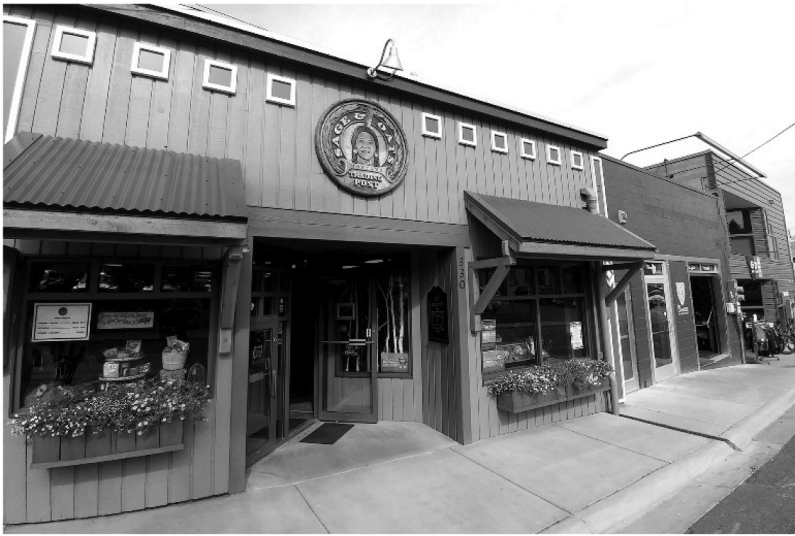
Figure 2. “Back alley” façades of eclectic boutique and bicycle shop, Helena, MT (9/11/18).