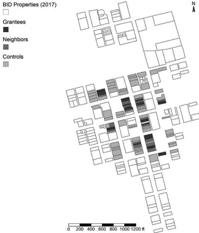
Figure 1. Quantitative study sample, Kalispell, MT. Derived from Flathead County GIS Department parcel data (2019).