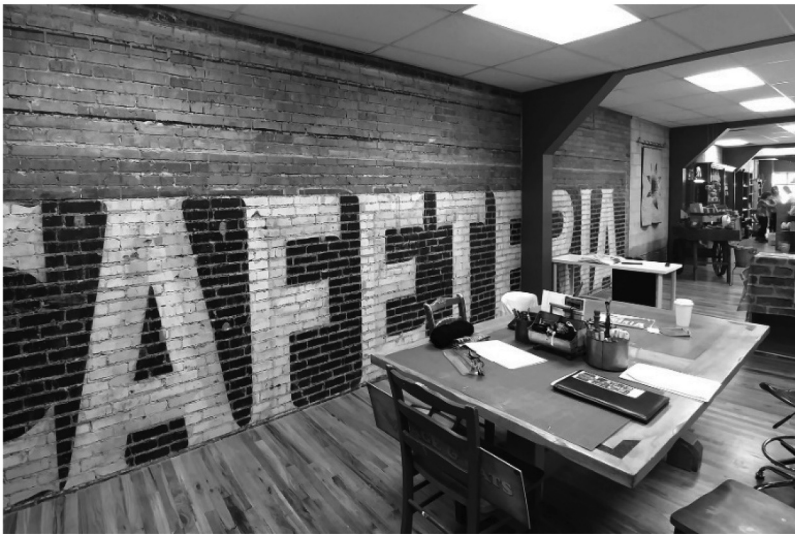
Figure 3. Interior ghost sign, Helena, MT (9/11/18).

One concern Michelle had was about longevity in their current location. With a one-year lease, and even after all the renovation work, they were already debating moving to a more well-traveled location. In terms of city benefit, the building will remain renovated for the next tenant and the adjacent spillover improvement will remain. Thus, regardless of the longevity of the eclectic boutique at this location, the impact to the building, block, and community will stand.